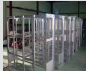
Membranes inside the tank