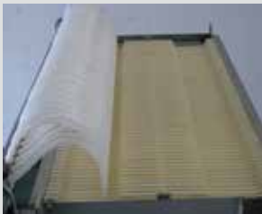
View suction area