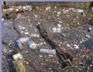
Waters with high organic load