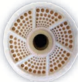
Interior views Membranes