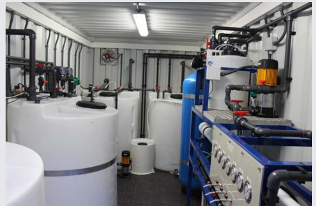
Interior of the Reverse Osmosis container