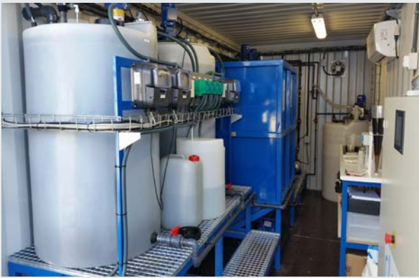
Interior of the Physical - Chemical container

We propose a comprehensive system in three phases : Pretreatment or primary roughing, physical-chemical treatment, and a combined treatment of Membranes (Ultrafiltration, Nanofiltration and Reverse Osmosis). The development of these membranes are the result of years of research, and are made exclusively for Dim Water Solutions equipments .