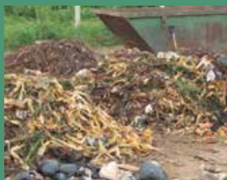
Biogas produced from Municipal solid waste landfills