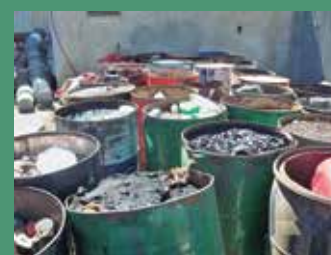
Biogas from Industrial waste