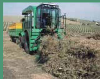
Biogas from agricultural waste