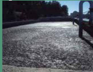
Biogas from sludge digestion of WWTP